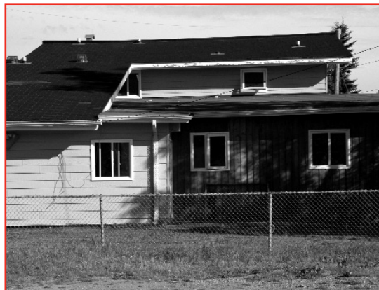
Workplace health and safety issues continue to plague the Children's Receiving Home.

In addition to the presence of mould, Minister Cathers confirmed the presence of asbestos in the walls.