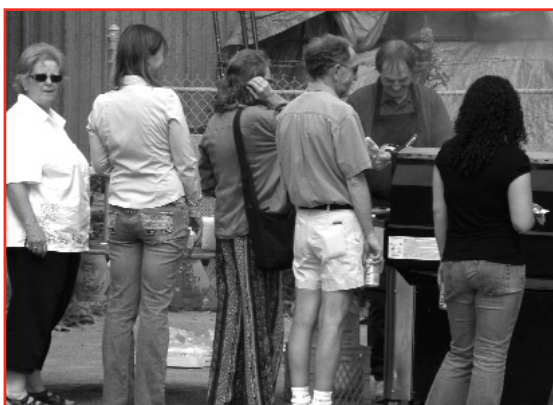
PSAC hosted a barbecue at the YEU office on July 18th. It was the first of several events offered as part of the Public Services are Cool campaign.

PSAC is taking a message about quality public services out into the fresh air this summer. Members will be handing out "Public Services are Cool!" fans and leaflets at outdoor events. They'll be meeting with MPs and federal candidates to raise issues and promote the benefits of quality public services.