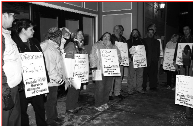
PSAC members and supporters rallied outside the Westmark Whitehorse on February 18, during the Treasury Board President's address. They were voicing their concern about cuts to public programs.

heard, none is more influential than the voice of a convention delegate. If you are interested in taking part in the convention and becoming a delegate, make your interest know