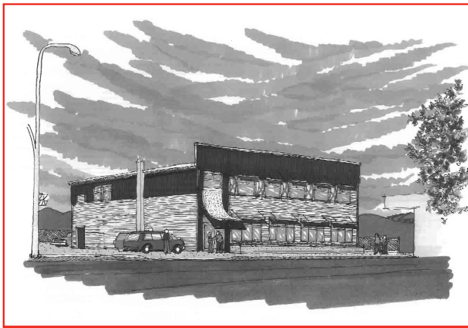
The design for renovations to the YEU Union Hall was unveiled on Saturday, April 5, before a special YEU Convention.

Following debate on the only motion before the meeting, members voted overwhelmingly to approve the modified budget, and