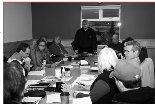
Shop Steward Round Tables offer an opportunity for members and Stewards to advance their labour education and improve their representation skills. This session was held November 18.

YEU is YOU, regardless of whether you are a seasoned union activist or a member who has never explored what the Union is about. We welcome your increased participation and hope you will take the opportunity to get more involved through training.