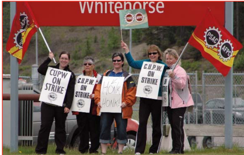
YEU members and staff support the local CUPW members on the picket line.

by union-busting success, we can expect the Harper government to initiate further attacks on public service unions.